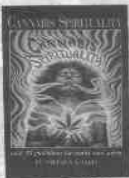
PB HB06 $9.95 HB HB07 $15.95