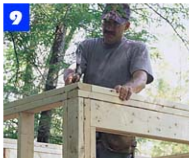
Frame and raise the remaining walls without sheathing. After nailing together the corner studs, add the top plates.