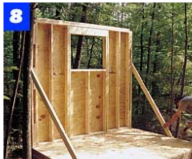
Install 1/2-in. plywood wall sheathing on the framed back wall. Then, raise the assembly and secure it with diagonal braces.