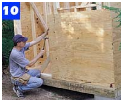
When the framing is in place and the assembly is square and plumb, add the remaining plywood sheathing.