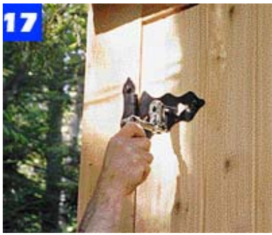
Position the door in its opening with a 1/4-in. space at the top and sides. Bore pilot holes for the hinge screws and secure the hinges.

locations. Bore pilot holes and fasten the hinges to the shed. Position the door with a 1/4-in. space on the sides and top, and mark the hinge holes. Bore pilot holes and mount the hinges (Photo 17). Install the door pull and hasp. Cut the doorstops and nail them in place on the top and open-side jamb. Then, stain or paint the windows, door and remaining trim.