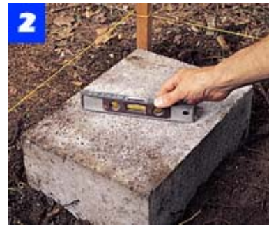
Dig a hole for the first block at the highest point in the grade. Add gravel, install the block, align it with the string, and level it.

Use a long, straight 2 x 4 and level to check the relative height of the second corner, then excavate the site for the block. Check that the second block is level with the first (Photo 3), and add the remaining corner blocks in the same way.