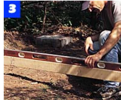
Use a straight 2 x 4 and a 4-ft. level to check that the corner blocks are installed at the same height.