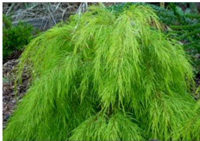
Acacia cognata 'Lime Cascade', approx 1m x 1m