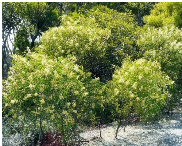
Acacia alcockii (taken at Billy Light's Point, Pt Lincoln)

species often (but not always) have pale coloured flowers (as this one does) – why is this so?