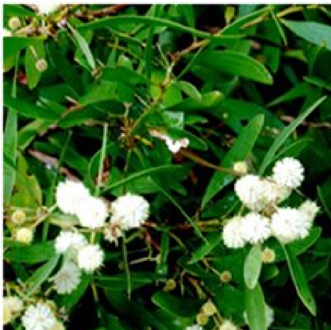
Acacia melanoxylon 'Snow Drops', approx 2m x 3m