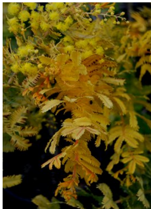
A gold foliated Acacia baileyana, gold in late winter spring on the new growth. It may be called 'Winter Gold'.