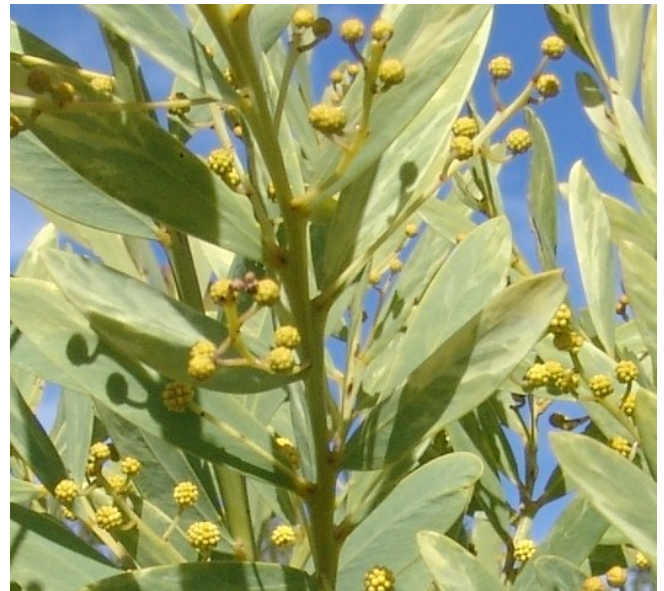
Variegated Acacia jennerae

"I grew this plant from seed about six years ago and it always had yellowish leaves. I assumed it had some deficiency in the soil but all the other plants nearby were normal. At times I wasn't even sure if it was a Hakea or an Acacia due to its odd appearance. At the end of every summer the leaves would seem to become greener. The bush is growing in full sun and is never watered. This year for the first time it started to flower and it was obvious it was indeed an Acacia . It was flowering very late in November. I keyed it out and it appears to be Acacia jennerae . As well as flowering for the first time the leaves have changed slightly to be variegated. It stands out growing in front of dark green leafed plants."