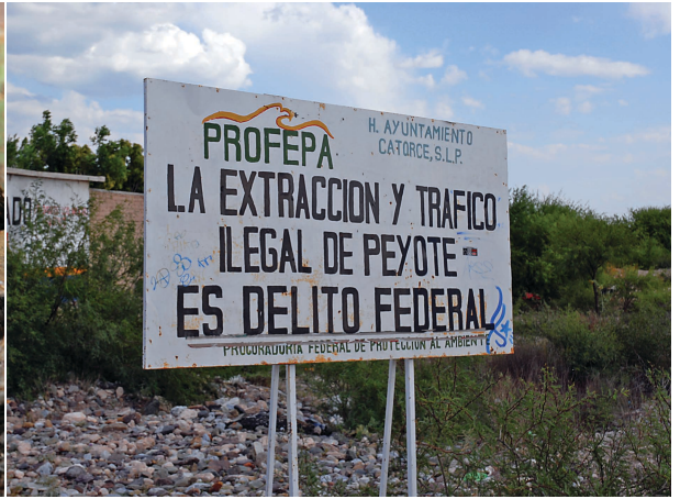
L. williamsii is sparse in the alluvial flats below Real de Catorce, San Luis Potosí, reportedly due to chronic over-harvesting concomitant to “narcotourism” and other commercial peyote harvesting enterprises, despite large signs warning: “The extraction and illegal trafficking of peyote is a federal offense.”

edly strict enforcement of laws to punish outsiders who might extract peyote from this area (which is protected as Wirikuta, the sacred land where the Huicholes come annually to gather peyote) there were people who had hauled out great quantities of peyote from local populations for sale in some unspecified distant market. I told him that we were searching for peyote for a scientific study, but that we were having difficulty finding enough plants. He looked down at the ground where we were talking and pointed with his herding stick: “There’s one.” And then there was another, and another, until we had our ten tissue samples. The sound of the goat bell disappeared into the deepening dusk as