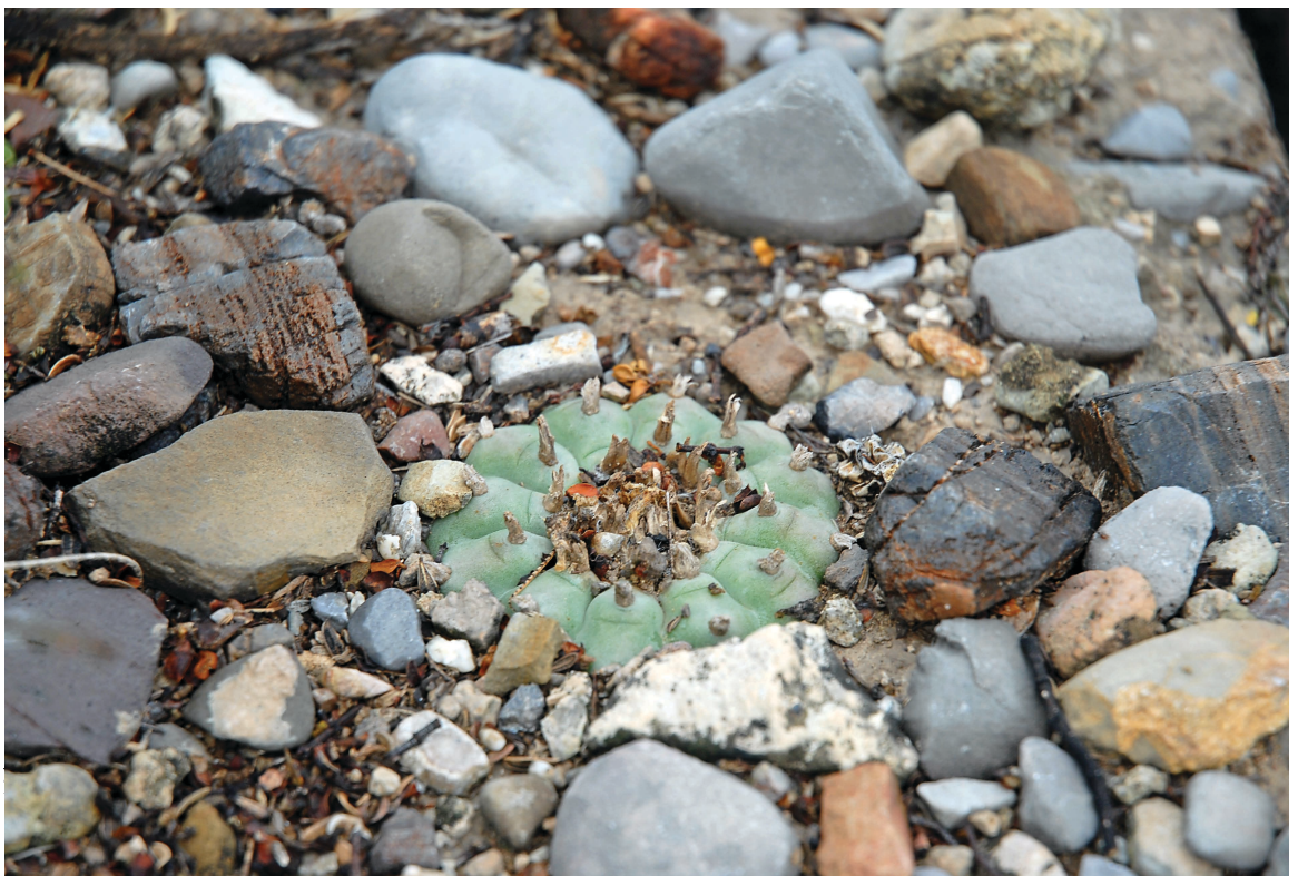
L. williamsii lays low at a site north of Doctor Arroyo, Nuevo León.