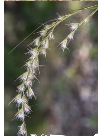
1: The hard seeds of Gahnia sieberana are ready to collect when red. 2: Casuarina seeds remain in the fruit until it is removed from the tree and the capsules dry and open. 3: These eucalypt fruits have already opened and released their tiny seeds. 4: These wallaby grass seeds are ripe and fluffy and ready to drop.