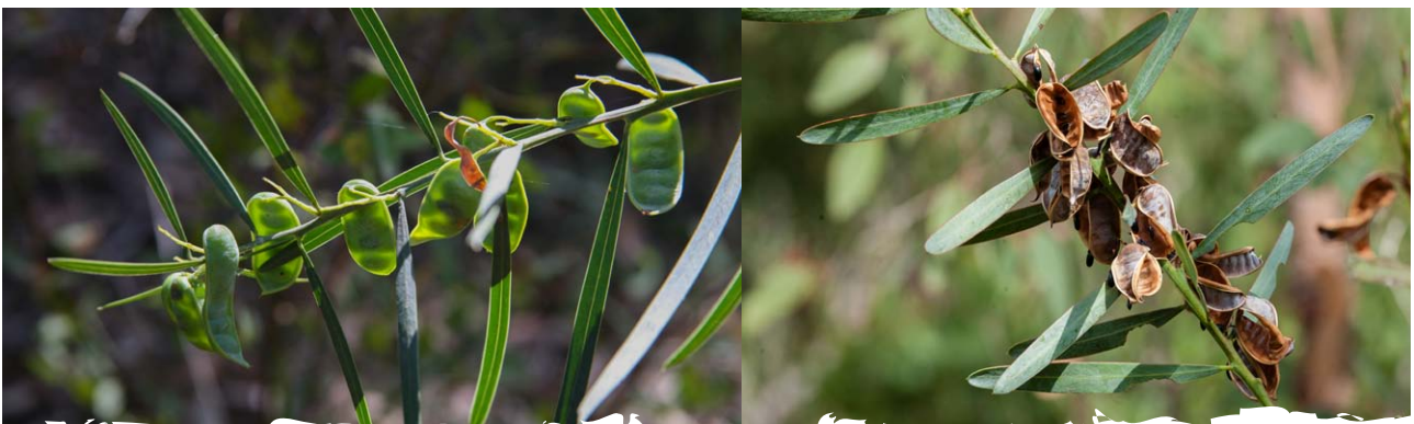
Wattle seed pods, such as this sweet wattle become brown and dry when ripe. They open quickly and the seed is dropped.

Many plants found in rainforests have fleshy berries. Berries often change from green to another colour and become soft when mature.