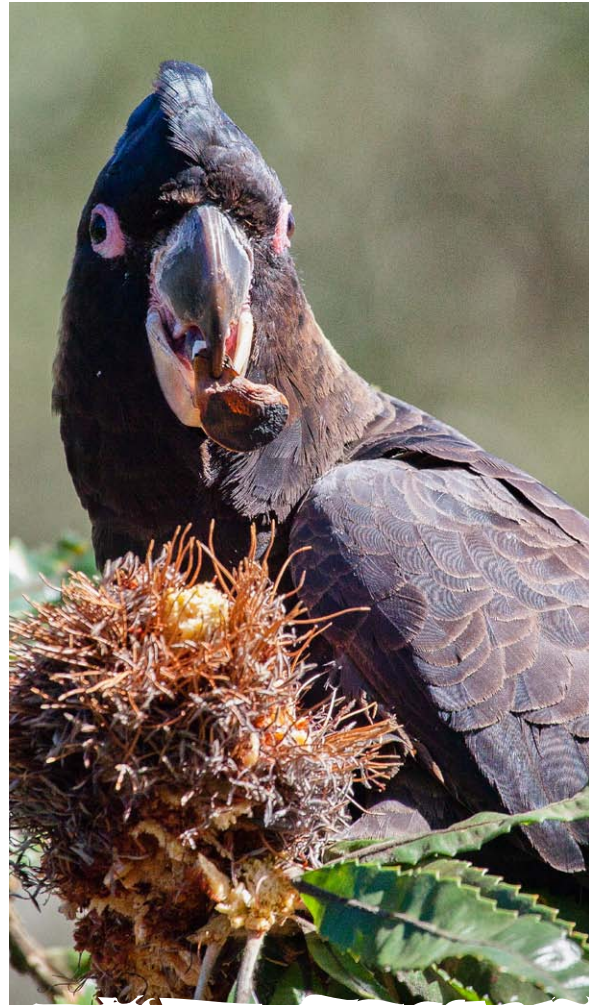
The hard capsules on Banksia serrata cones protect the seeds from bushfires and most predators, but the yellow-tailed black cockatoo has a powerful enough bill to break through and access the nutritious seed.